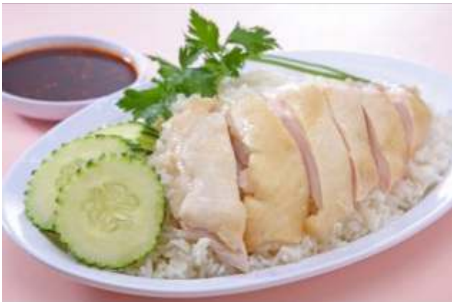
Hainan Chicken Rice $12

Jasmine Rice / Fried Garlic / Scallion / Pepper