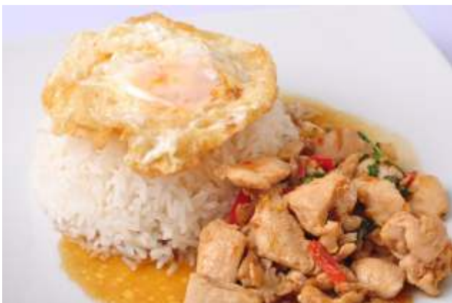
Spicy Basil Sauce Over Rice