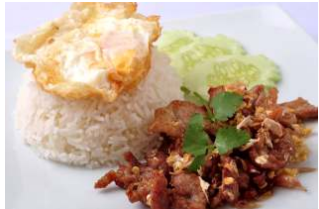
Garlic Sauce Over Rice

Chicken Thigh / Ginger Rice / Cucumber Served with Chicken Broth and Ginger Spicy Sauce (Steamed Chicken) or Sweet & Sour Sauce (Fried Chicken)