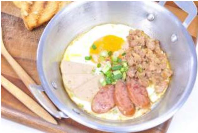
Egg In The Pan $10

2 Eggs / Sausage / Bacon / Ham / Green Onion / Pea-Carrot - Choice of White or Wheat Bread